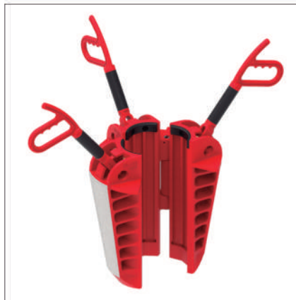
Rotary Slip with Flex Handles