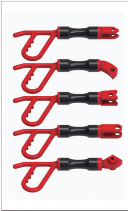
Safety Flex Handles

Flex handles allow safer and much easier handling and operation of manual rotary slips. MOT offers a wide selection of safety flex handles to fit your needs.