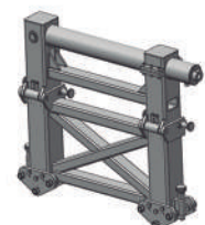
Push & Pull Assy.